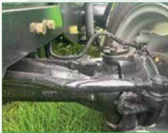
OIL-IMMERSED DISC BRAKES ON ALL FOUR WHEELS