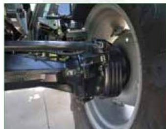
FOUR WHEEL BRAKING DELIVERING SAFER, MORE STABLE STOPPING