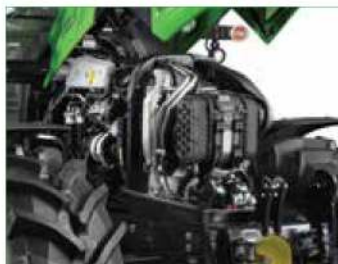
TIER 3 FARMOTION ENGINE 4-CYLINDER TURBO INTERCOOLED