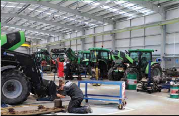
QUALITY NATIONWIDE PARTS AND SERVICE

With a Deutz-Fahr tractor you are not only investing in over 150 years of manufacturing excellence, you are also getting the support of a highly professional global parts and service organisation.