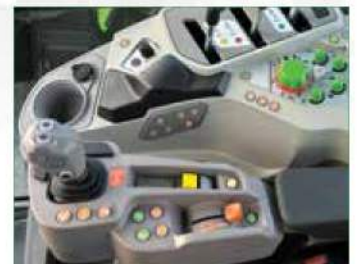
20 SPEED ELECTRONIC ARMREST CONTROLLED FULL POWERSHIFT TRANSMISSION

The 6135C is equipped with a 20 Speed Range Variable Powershift transmission, delivering smooth, efficient performance across a wide range of applications.