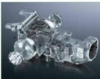
ZF 6-STAGE POWERSHIFT TRANSMISSION RC MODELS

The 6G Series is built to perform across a wide range of applications, from demanding tillage work through to transport and operating high-capacity seeders or fertiliser spreaders. Packed with advanced features including an adjustable Power Shuttle, iMonitor and ISOBUS, it delivers precision, efficiency and ease of use. Its compact design ensures excellent manoeuvrability, while the well-balanced power-to-weight ratio makes it a versatile and reliable performer for any task.