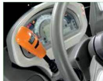
WET CLUTCH WITH SENSE CLUTCH SHUTTLE MODULATION CONTROL ALLOWING SMOOTH DIRECTIONAL CHANGES