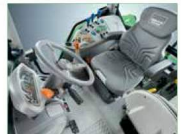
SPACIOUS ERGONOMIC AIR-CONDITIONED CABIN WITH HI-VIS GLASS ROOF HATCH - IDEAL FOR LOADER WORK

The Deutz-Fahr 5125G HD is a robust mid-power utility tractor within the 5 Series, first introduced in 2017 and built to handle demanding day-to-day tasks with ease. Powered by a 4-cylinder, 3.9L FARMotion diesel engine, it delivers 126hp with strong torque of up to 500 Nm at around 1600 rpm, providing reliable performance when it counts.