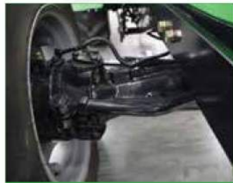
FRONT AXLE BRAKES WITH 4WD BRAKING FOR IMPROVED SAFETY, TRACTION AND REDUCED BRAKE WEAR