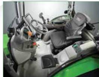
FLAT FLOOR FOR ENHANCED OPERATOR COMFORT