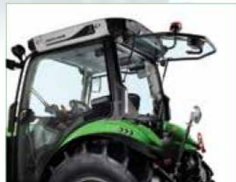
SUSPENDED CAB WITH CAT 4 CAB FILTRATION SYSTEM