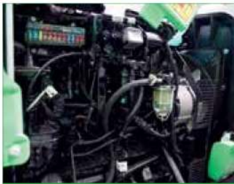
3 CYLINDER SDF 1000 SERIES TIER 3 ENGINE FOR RELIABILITY