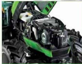
LIQUID-COOLED, ELECTRONICALLY CONTROLLED ENGINES WITH A WIDE CONSTANT POWER RANGE FOR LOW FUEL CONSUMPTION