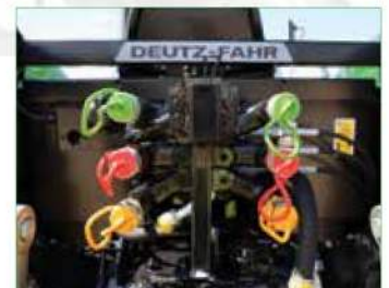
3 STANDARD HYDRAULIC REMOTES WITH ONE MANUAL FLOW DIVIDER

The Agrofarm 5 GS ROPS Series is the largest and most capable tractor in the Deutz-Fahr ROPS range, delivering an excellent power-to-weight ratio with the simplicity and reliability of a fuel-efficient, mechanically governed engine that customers know and trust.