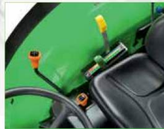
WET CLUTCH POWER SHUTTLE WITH 3-STAGE ECO-SPEED POWERSHIFT TRANSMISSION (45X45)