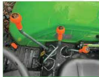
3-RANGE 15F/15R SYNCHROMESH TRANSMISSION WITH A HEAVY-DUTY 11" DUAL DRY CLUTCH FOR SMOOTH OPERATION