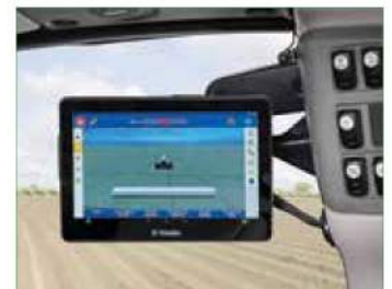
TRIMBLE DISPLAY SCREEN FOR AUTO GUIDANCE