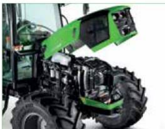
TIER 4 FARMOTION COMMON RAIL TURBO INTERCOOLED DIESEL ENGINE