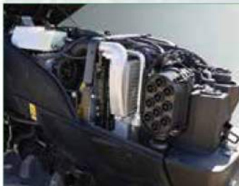
HIGH FLOW 100 L/MIN CLOSED CIRCUIT HYDRAULIC SYSTEM