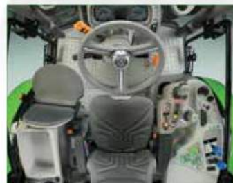
PRO-VISION CAB WITH PNEUMATIC SUSPENSION SEAT AND TRAINEE SEAT