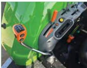
40X40 2-STAGE POWERSHIFT TRANSMISSION