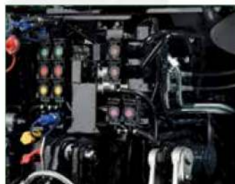
120 L/MIN CAPACITY CLOSED-CENTRE HYDRAULIC SYSTEM