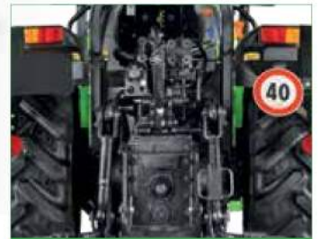
POWERFUL HYDRAULIC SYSTEM WITH A CAPACITY OF UP TO 60 L / MIN

The Agropius F Speciality Series includes two models, offering a narrow, compact 4WD cab tractor solution purpose-built for orchard and vineyard applications. Powered by a 4-cylinder turbo intercooled engine and equipped with engine speed cruise control, both models deliver smooth, efficient performance with a tight turning circle for working in confined rows.