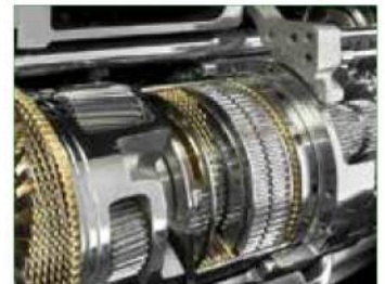
INFINITELY/CONTINUOUSLY VARIABLE TRANSMISSION