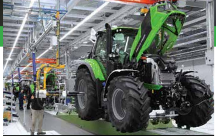
GERMAN ENGINEERING WITHOUT COMPROMISE

Deutz-Fahr tractors are built in Lauingen, the most advanced tractor manufacturing facility in Europe. This is where precision engineering, automated production, and decades of technical know-how come together. Every tractor is crafted to deliver maximum reliability, strength, and performance in real-world conditions.