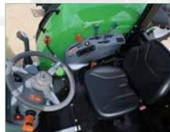
SPACIOUS ERGONOMIC OPEN STATION DESIGN