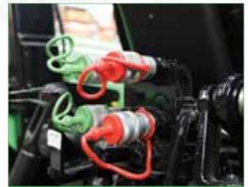
42 L/MIN HYDRAULIC PUMP WITH A DEDICATED STEERING PUMP FOR CONSISTENT FLOW TO THE STEERING ORBITAL

The Deutz-Fahr Agrolux 310 ROPS is a versatile, reliable tractor designed for a range of agricultural tasks. Powered by a robust engine, this model delivers impressive performance with its 40 km/h top speed, making it ideal for both fieldwork and transport.