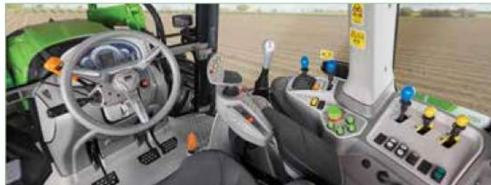
ZF 54 X 27 6-STAGE FULL POWERSHIFT TRANSMISSION (50KM/H)